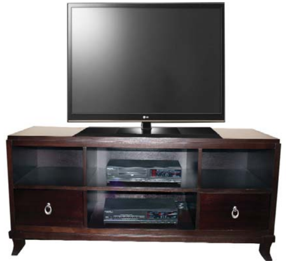
bottom: 42300 TV Stand